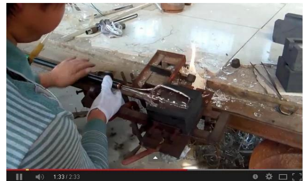
IS machine technology