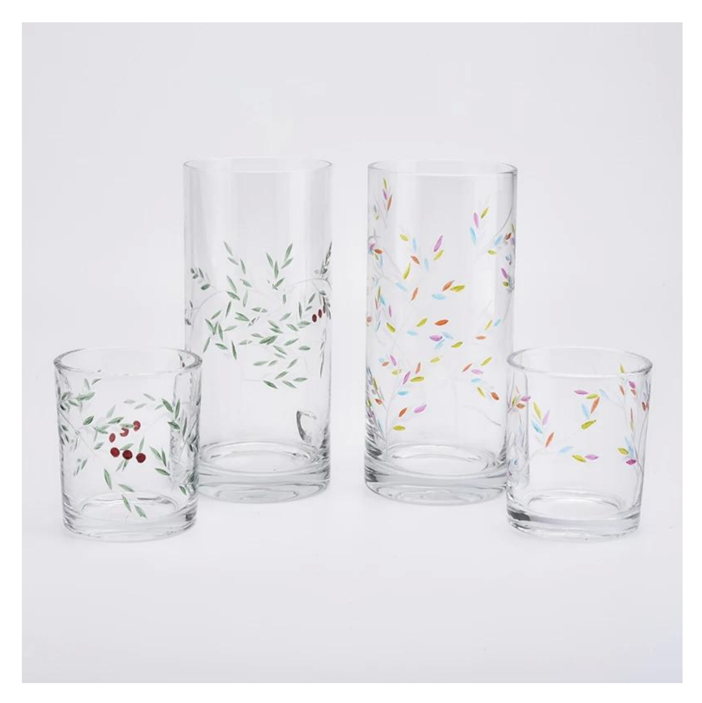
Why choose Sunny Candle Holder