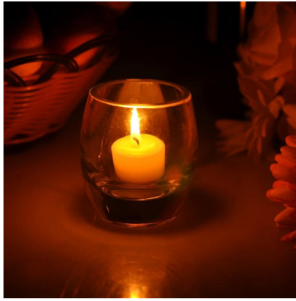
clear votive candle holder