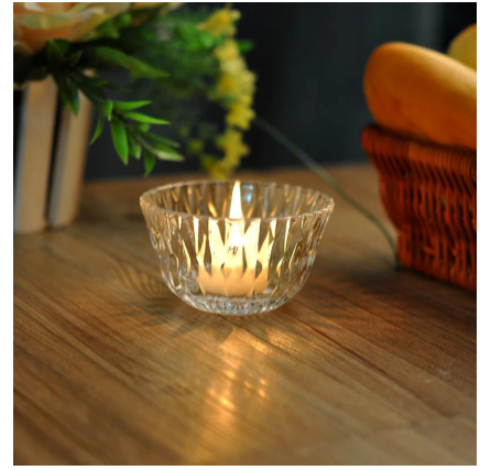
wholesale tealight candle holder