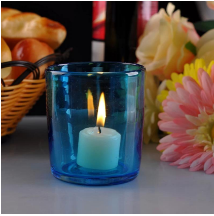
colored glass candle holder