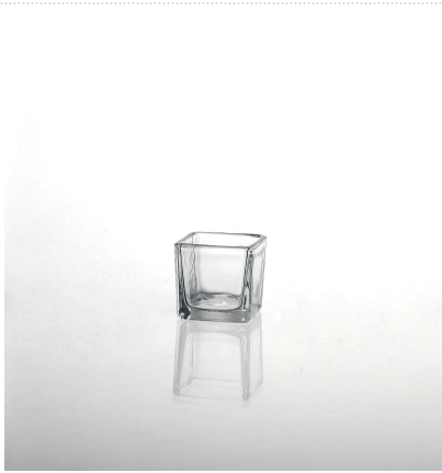
square clear glass candle holder