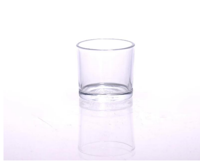
machine made glass candle holder