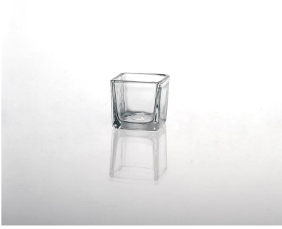
square clear glass candle holder