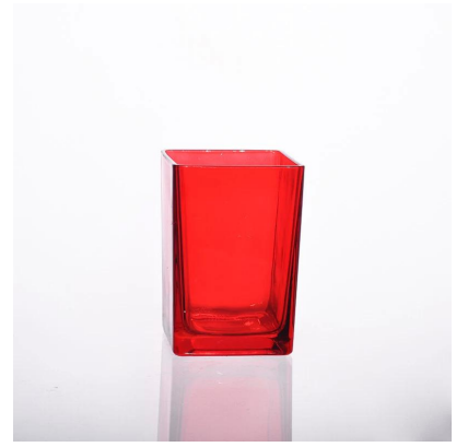
spray color glass candle holder