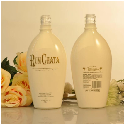
High quality vodka glass bottle with white painting