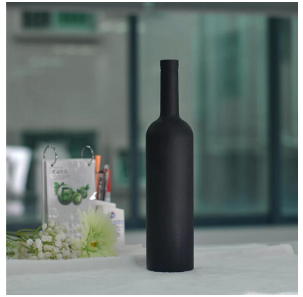
Spray glass red wine bottles wholesale