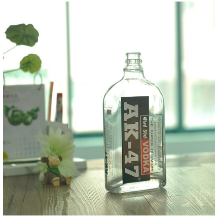
vodka glass bottle