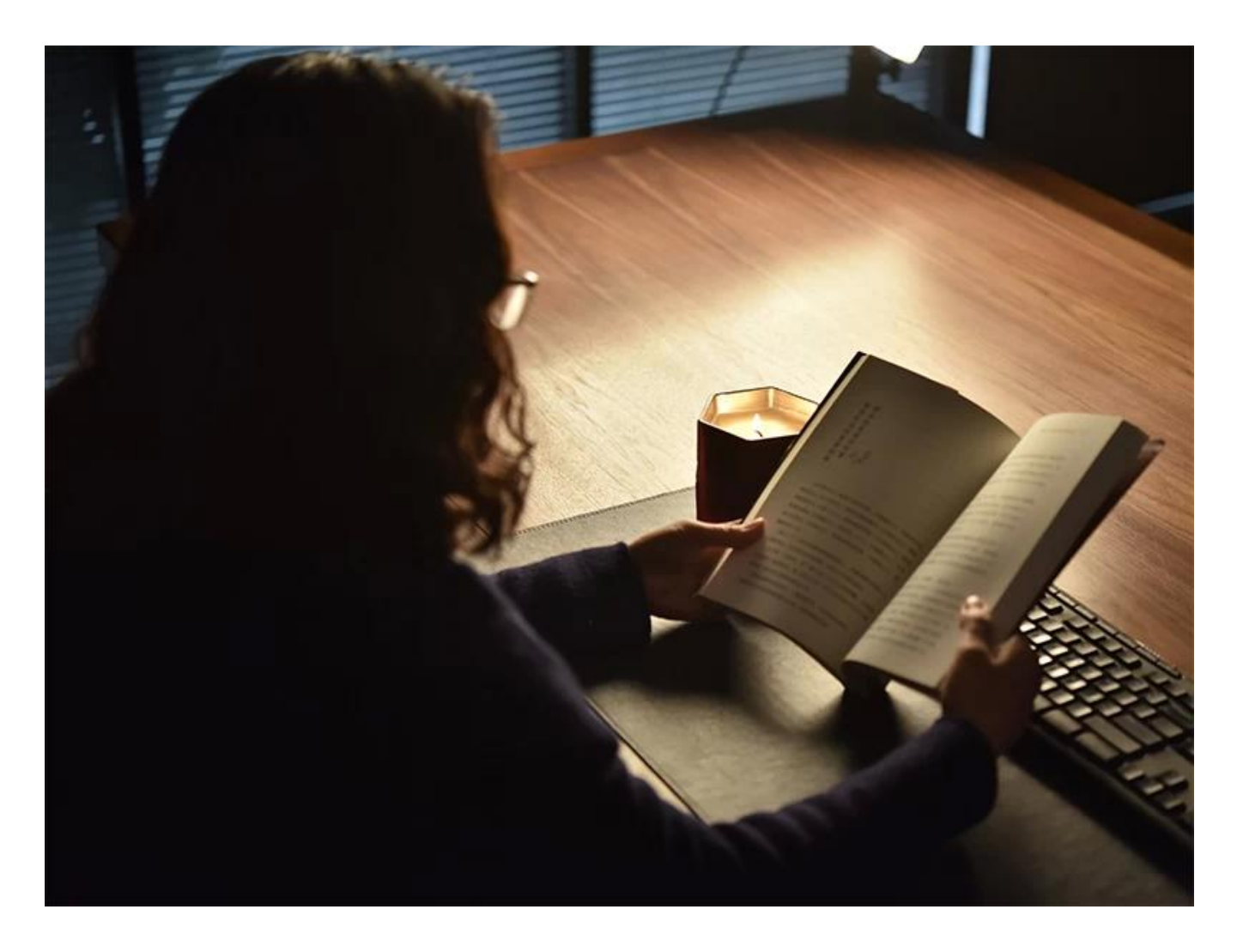
Story Story Story.