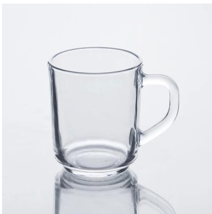
clear water glass mug