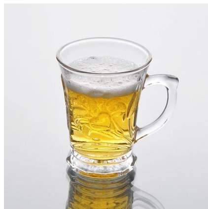
wholesale glass mug