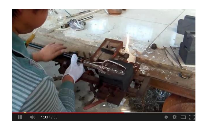
Hand Blown Technology