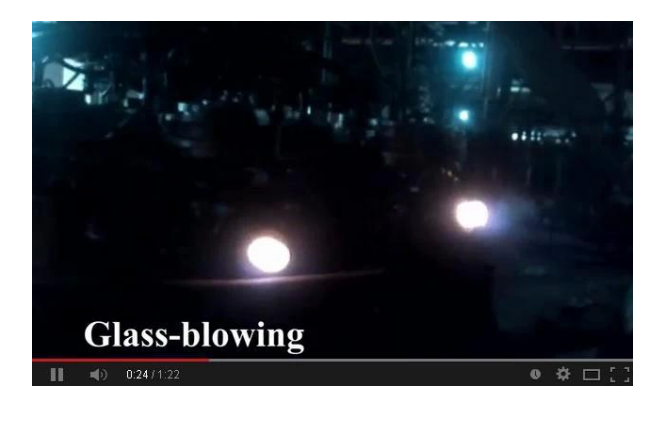
Machine Blown Technology