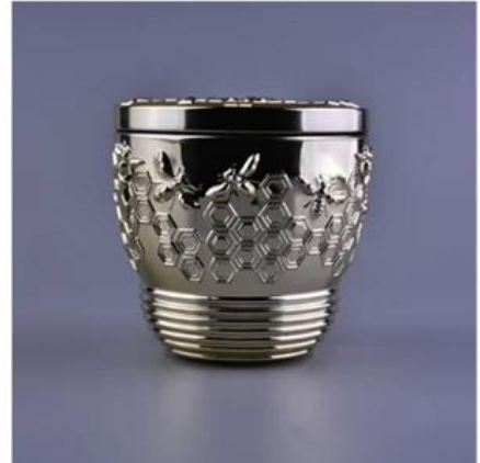
Sunny Brand Story