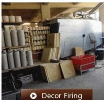
▶ Decor Firing