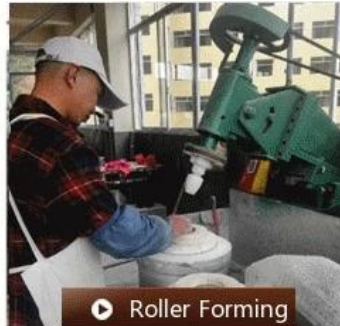
▶ Roller Forming