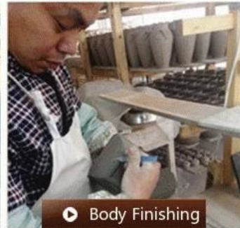
▶ Body Finishing