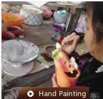
▶ Hand Painting