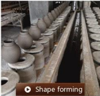
▶ Shape forming