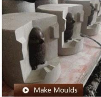
▶ Make Moulds