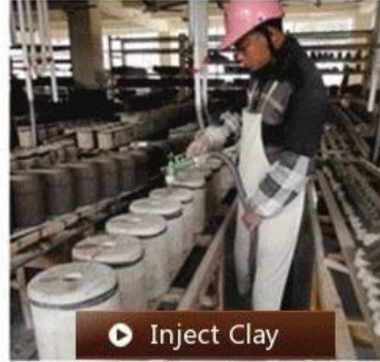
▶ Inject Clay