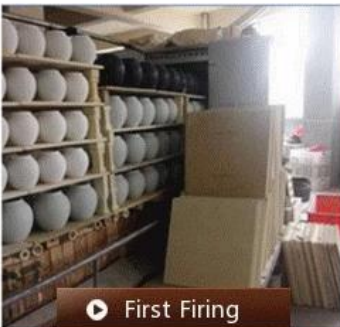
▶ First Firing