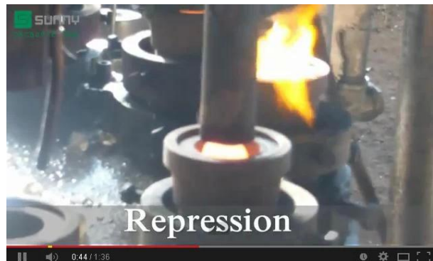
Mechanical press technology