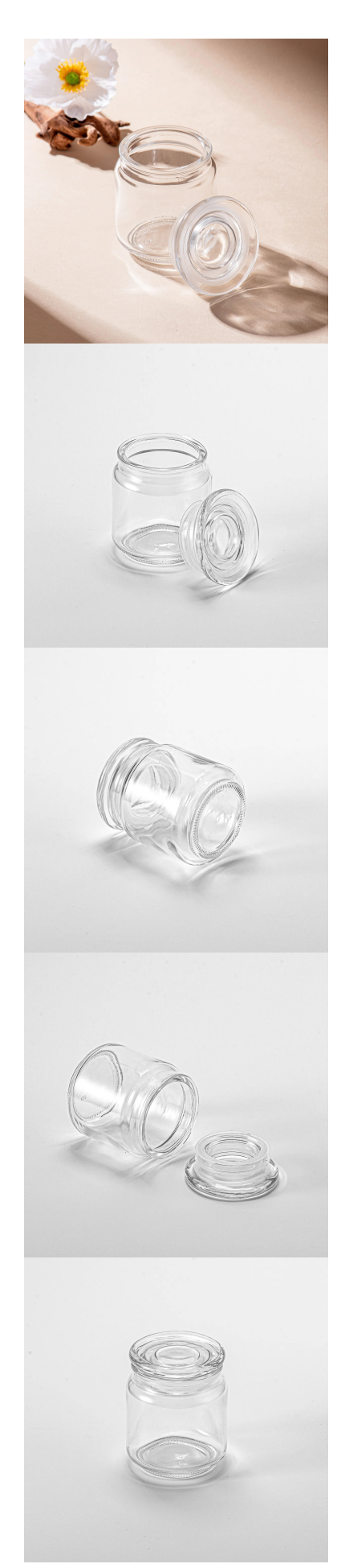
Application: Decorative dinner in the bar or bar . Suitable for families, hotels or gardens . Special lover gift . Any chance of decoration