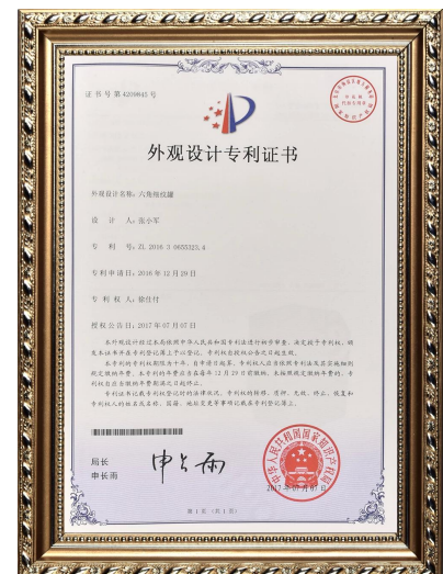
Patent No.: 201630655323.4