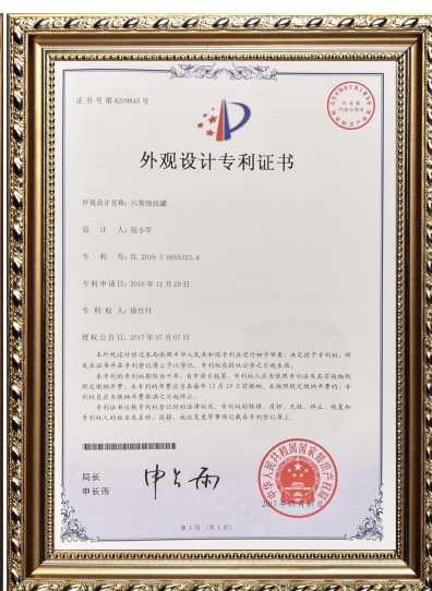
Patent no.: 20163065323.4