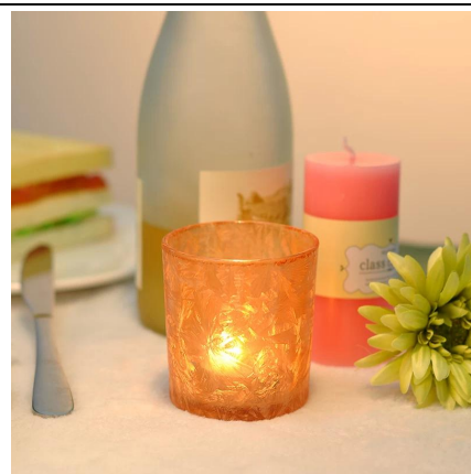
Frosted Glass Votive Candle Holders