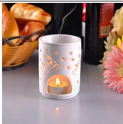
hollow design ceramic vigil lamp candle holder