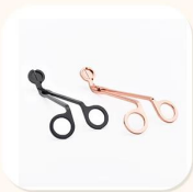
Wick Trimmer Cutter