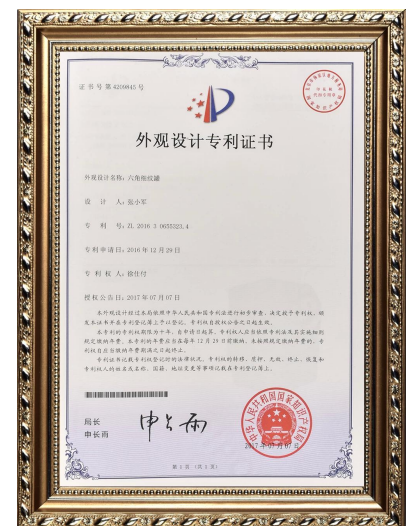
Patent number: 201630655323.4