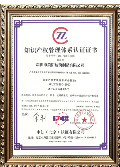
Corporate intellectual property