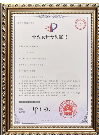
Patent no.: 201630655323.4