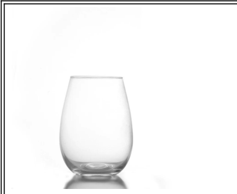
stocked machine blown stemless wine glass