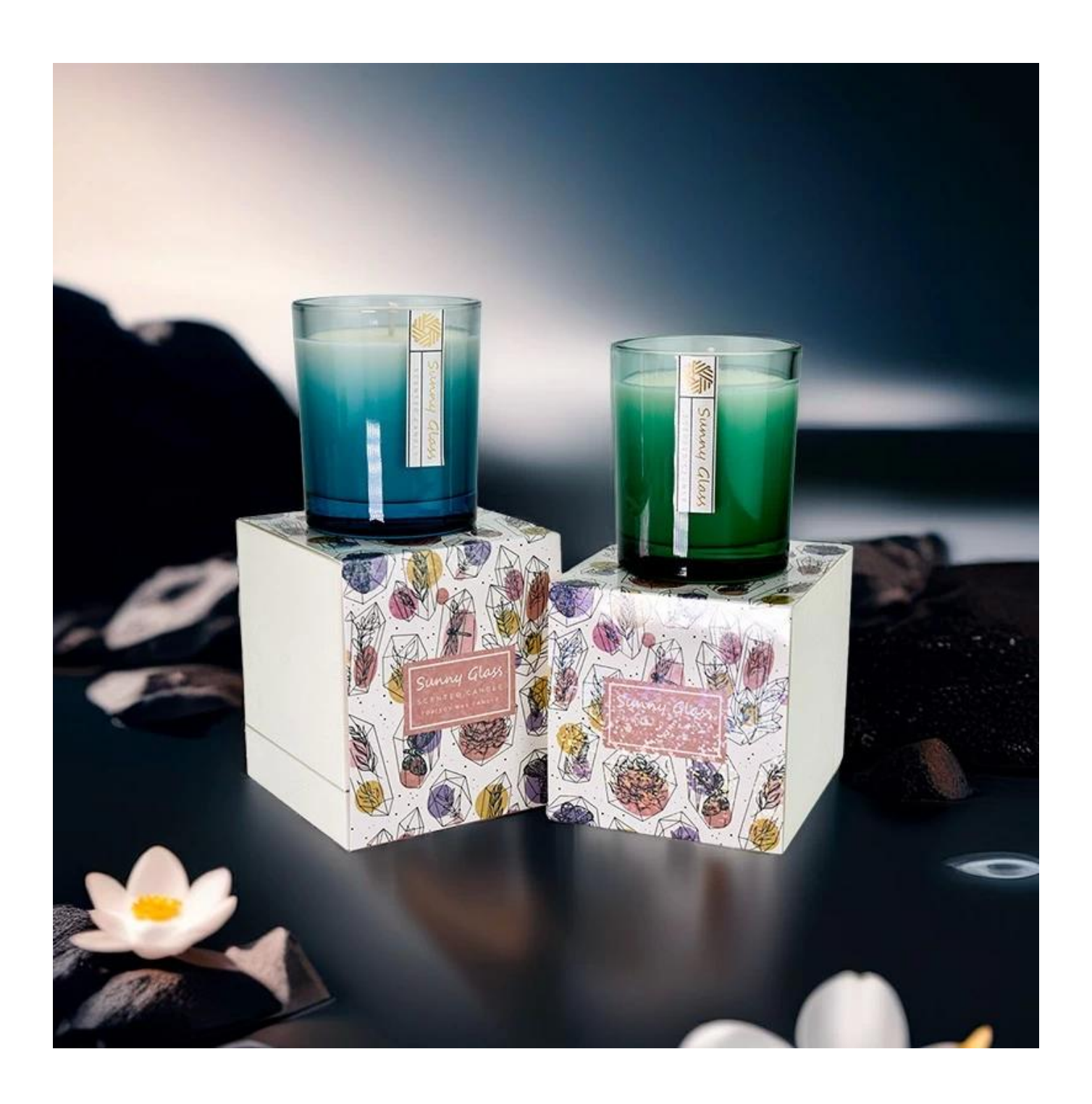
Why Choose Sunny Glassware