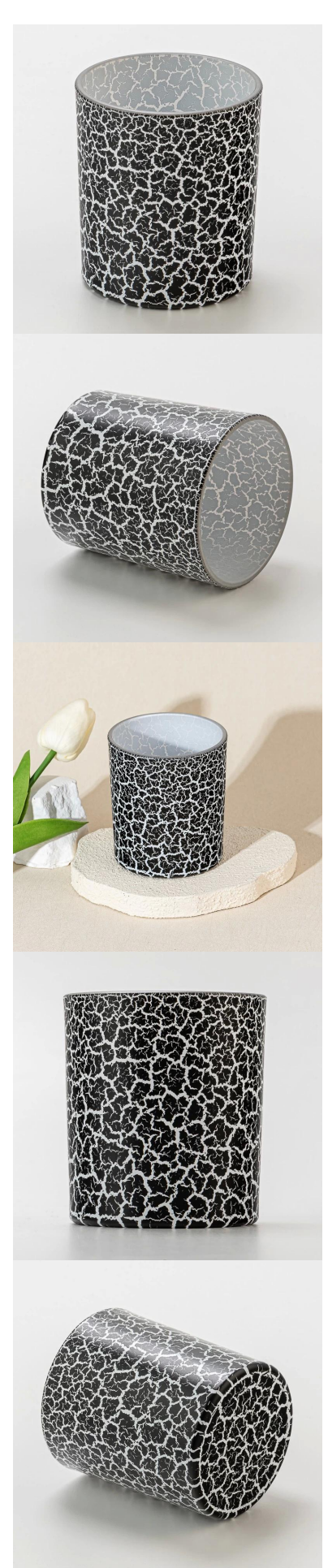
Application: Decorative dinner in the bar or bar . Suitable for families, hotels or gardens . Special lover gift . Any chance of decoration