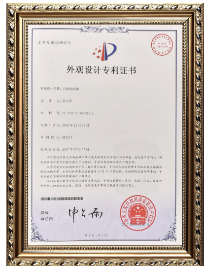
Patent n. 2.201630655323.4