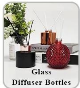
Glass Diffuser Bottles