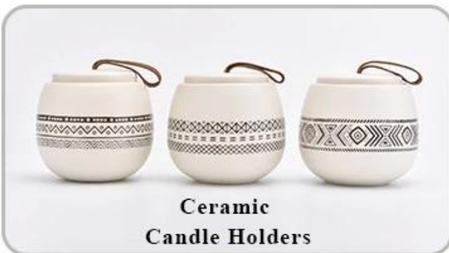
Ceramic Candle Holders