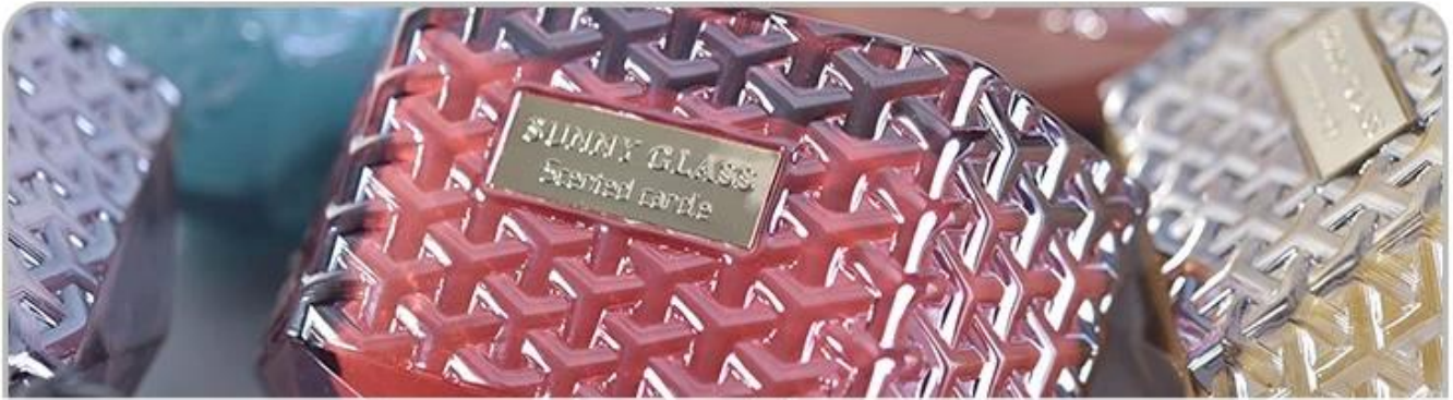
Glass Candle Holders