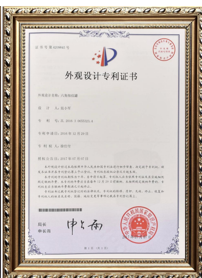
Patent no.: 20163065323.4