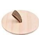
Pine wood lid