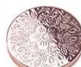
Zinc alloy embossed