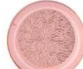
Zinc alloy embossed