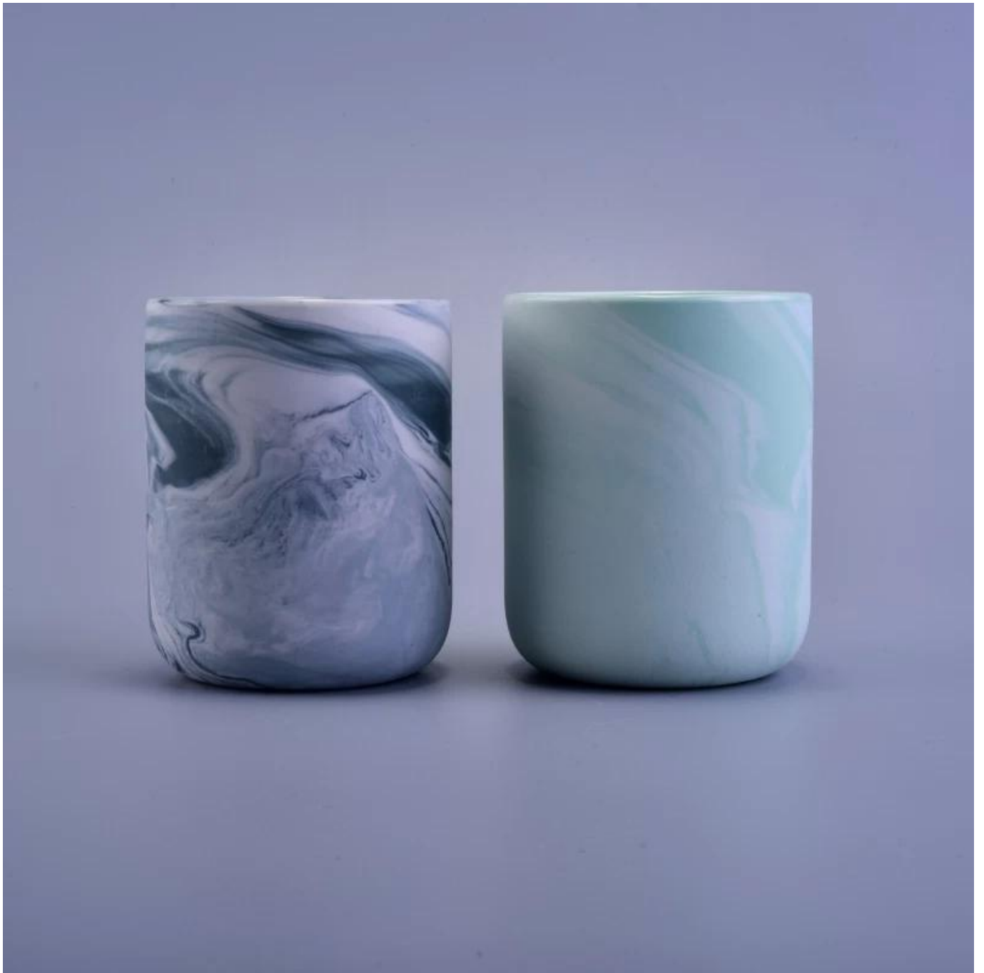
Candle lids accessories: