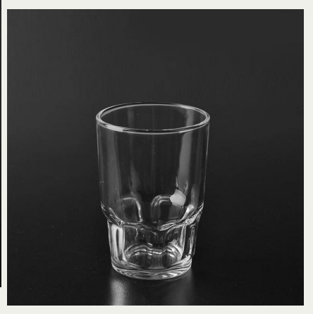
clear glass new design glasses