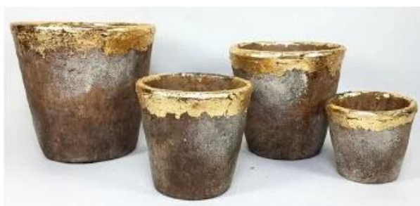
CS10025A-4 20.5x20.5x19.5cm CS10025B-4 17.5x17.5x16.5cm CS10025C-4 14.5x14.5x14cm CS10025D-4 11.5x11.5x10.5cm CS10025E-4 8x8x7cm