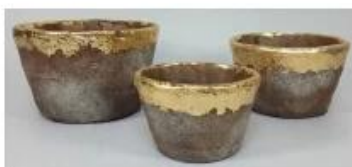
CS10026A-2 20x20x12.5cm CS10026B-2 17x17x10cm CS10026C-2 14x14x9cm