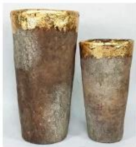
CS10024A-1 14x14x26cm CS10024B-1 11x11x20cm