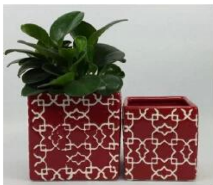
Red S16030-127 12.5×12.5×12.0cm S16030-102 10.0×10.0×10.0cm