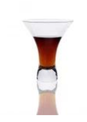
<u>clear whisky glass tumbler</u>