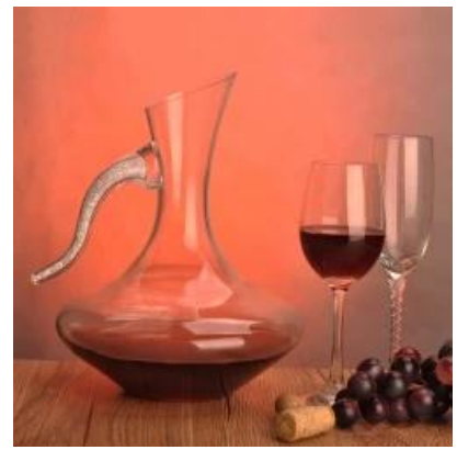
Hand quality handblown wine decanter