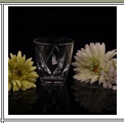
Personalized whiskey glass