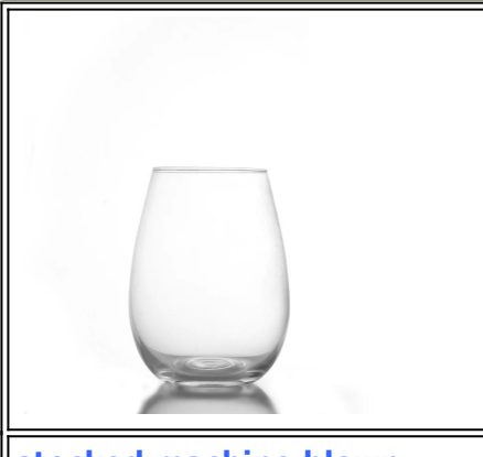
stocked machine blown stemless wine glass