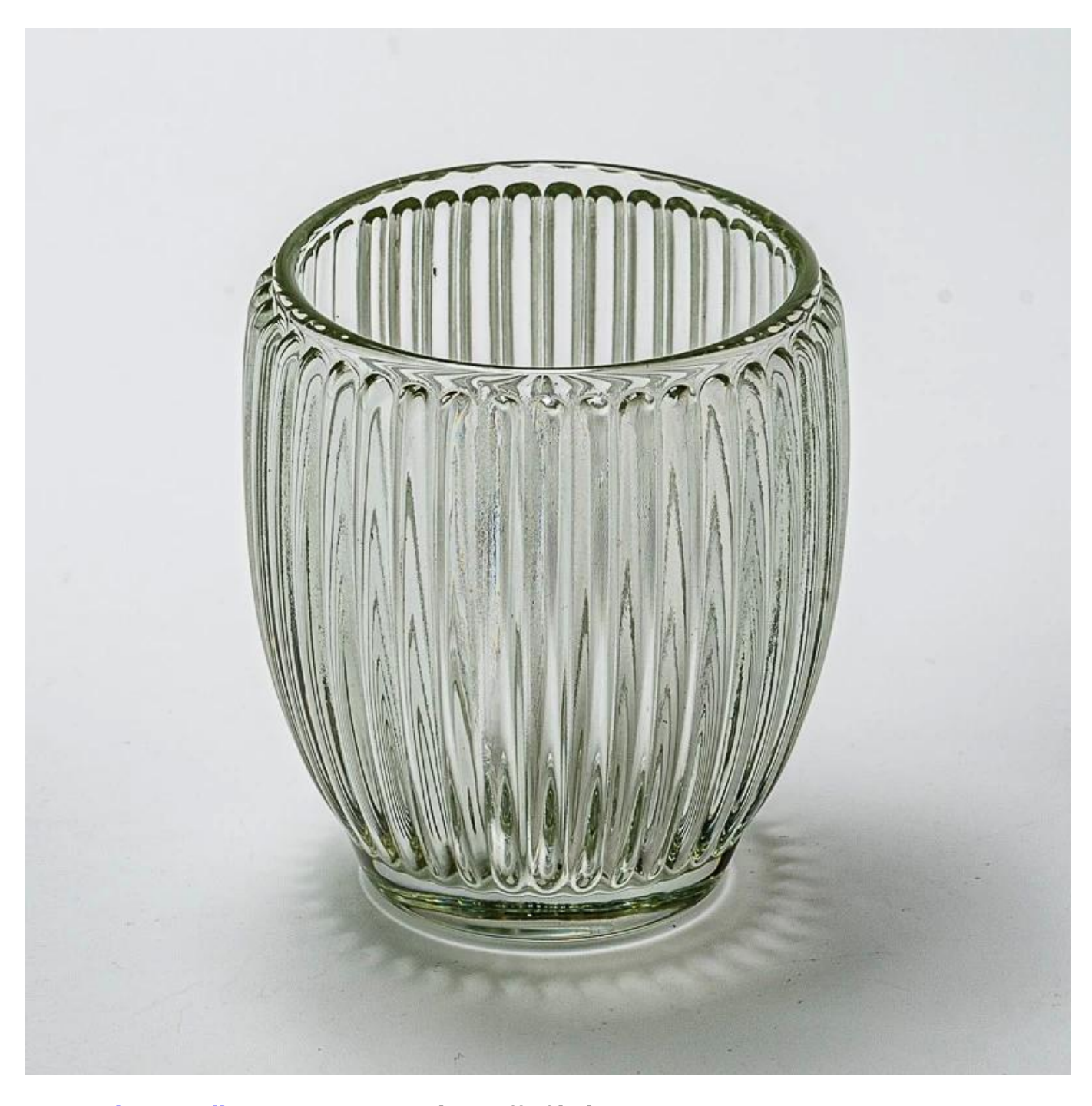
Stripe glass candle jar \cdot Stripes are the staff of light

The vertical striped texture breaks down the candlelight into countless prisms, and the wall instantly grows colorful bands like the aurora.