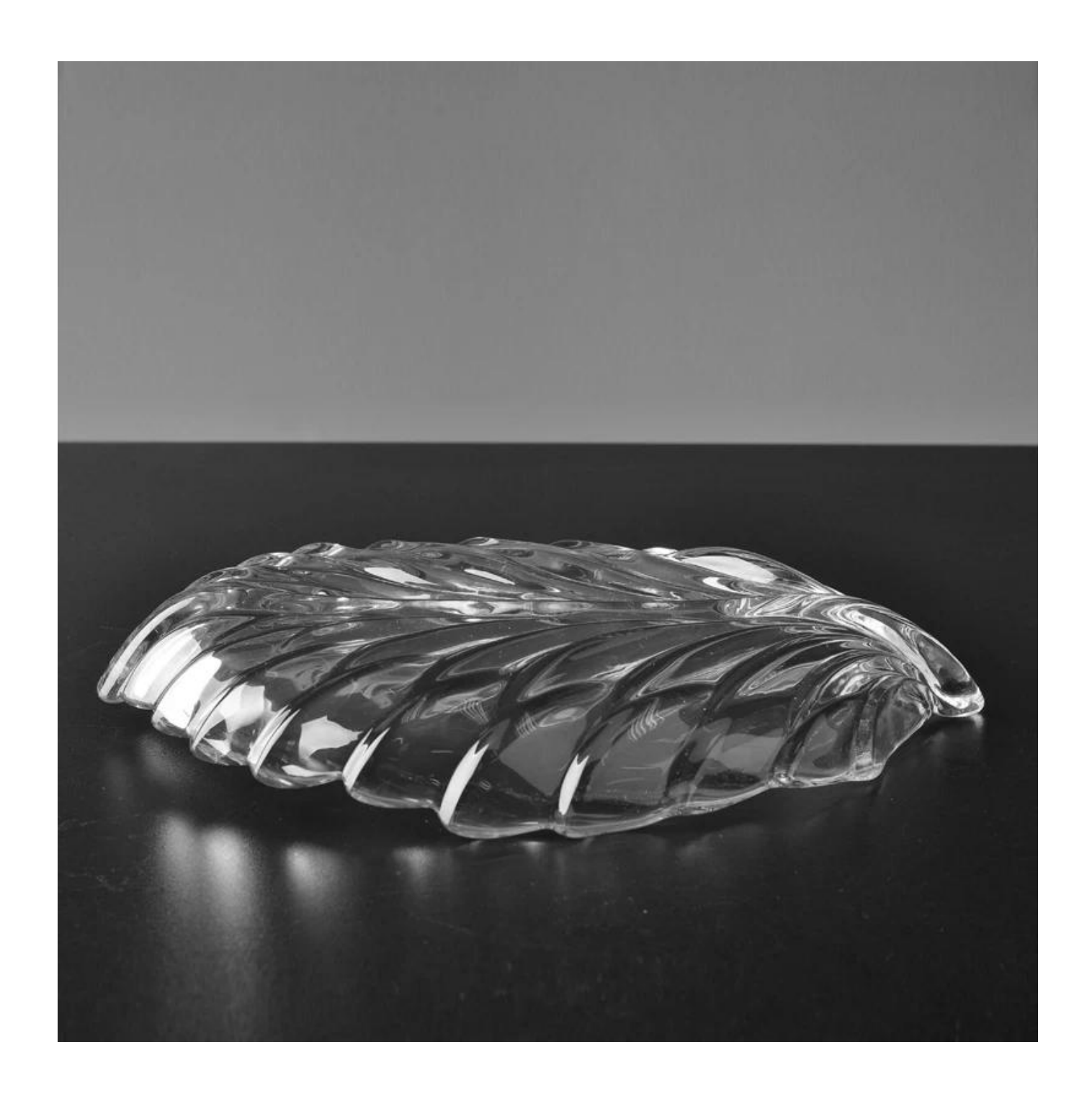
More household glass food containers and plates for your choice.