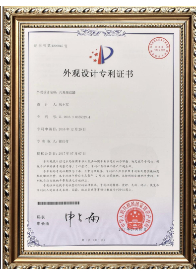
Patent no.: 201630655323.4