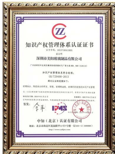
intellectual property company