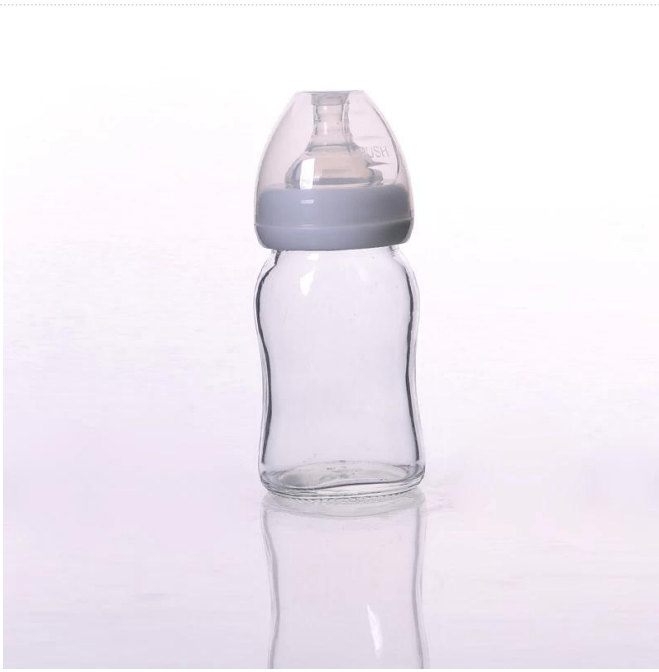
pyrex feeding bottle