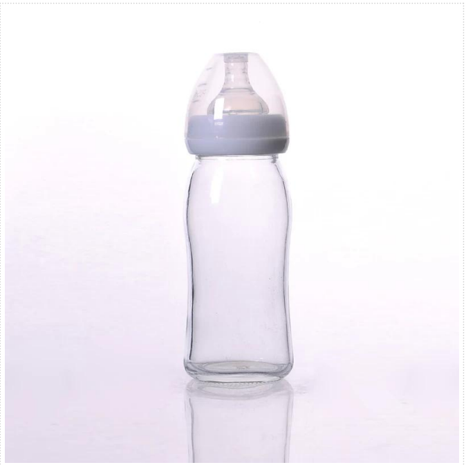
feeding bottle pyrex glass