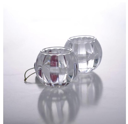
wedding candle holder