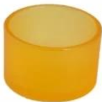
yellow candle holder