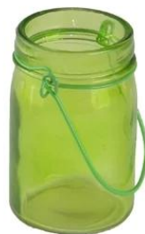
church candle holder