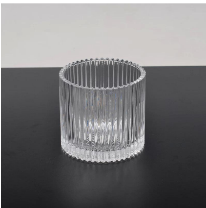
clear glass candle holder