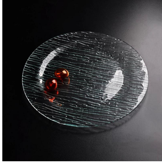
round clear glass plate