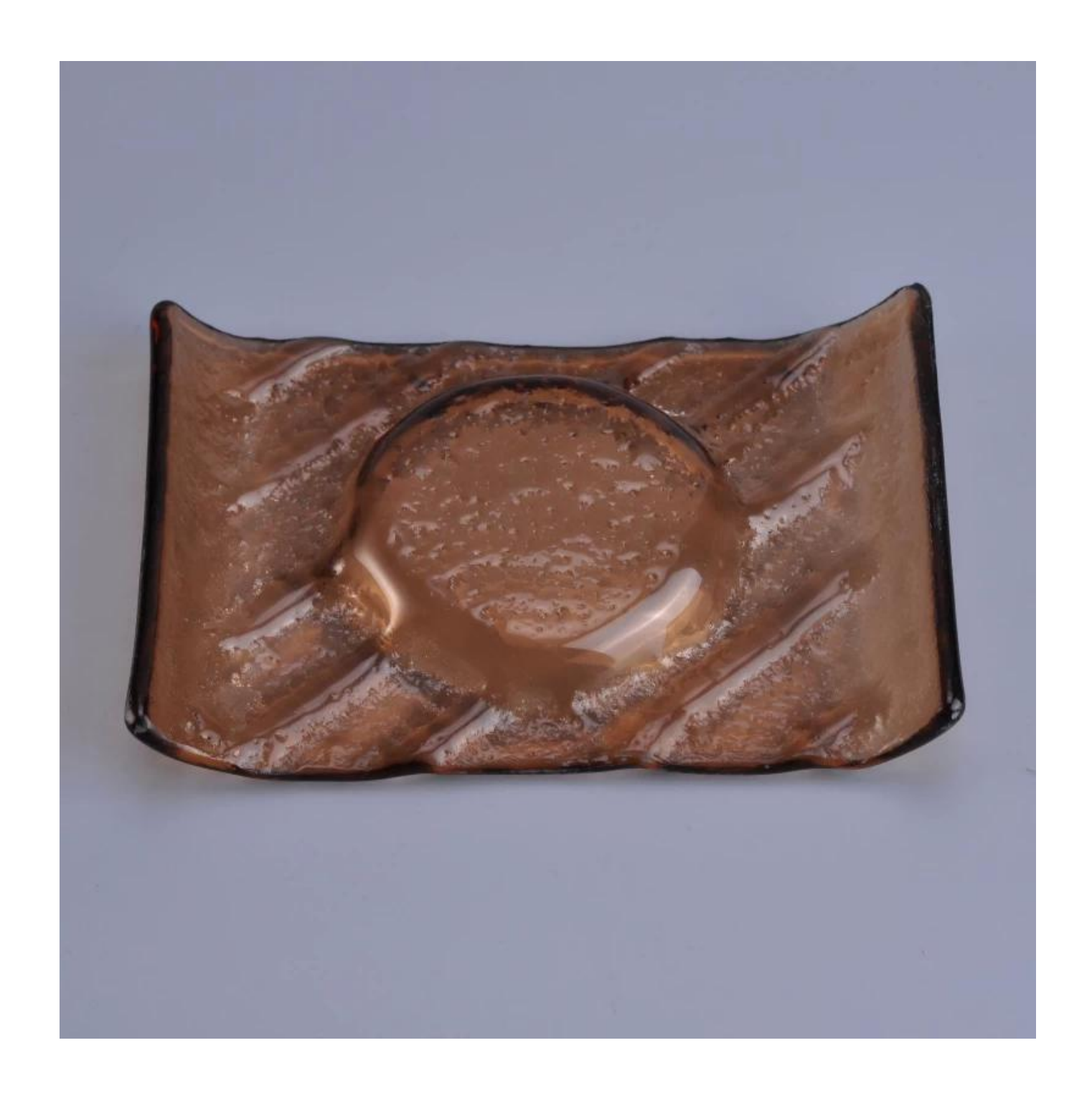
Multiple Design For Your Choice