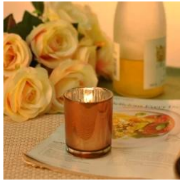
140ml Copper Candle Jar