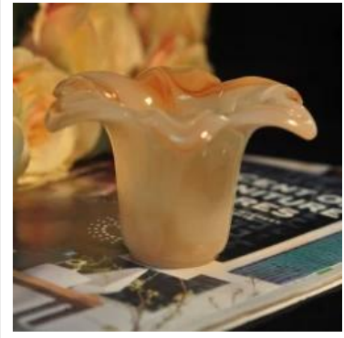
Flower shape cylinder jade amber color decorative glass candle jar candle holder