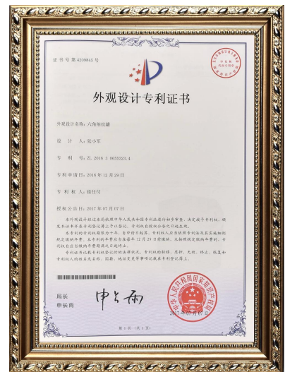
Patent Number: 201630655323.4