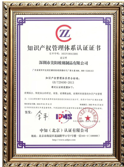
Enterprise Intellectual Property Patent No.:201630655323.4