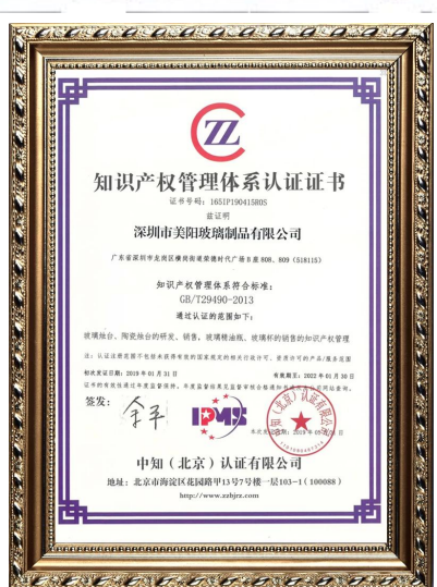
Corporate intellectual property