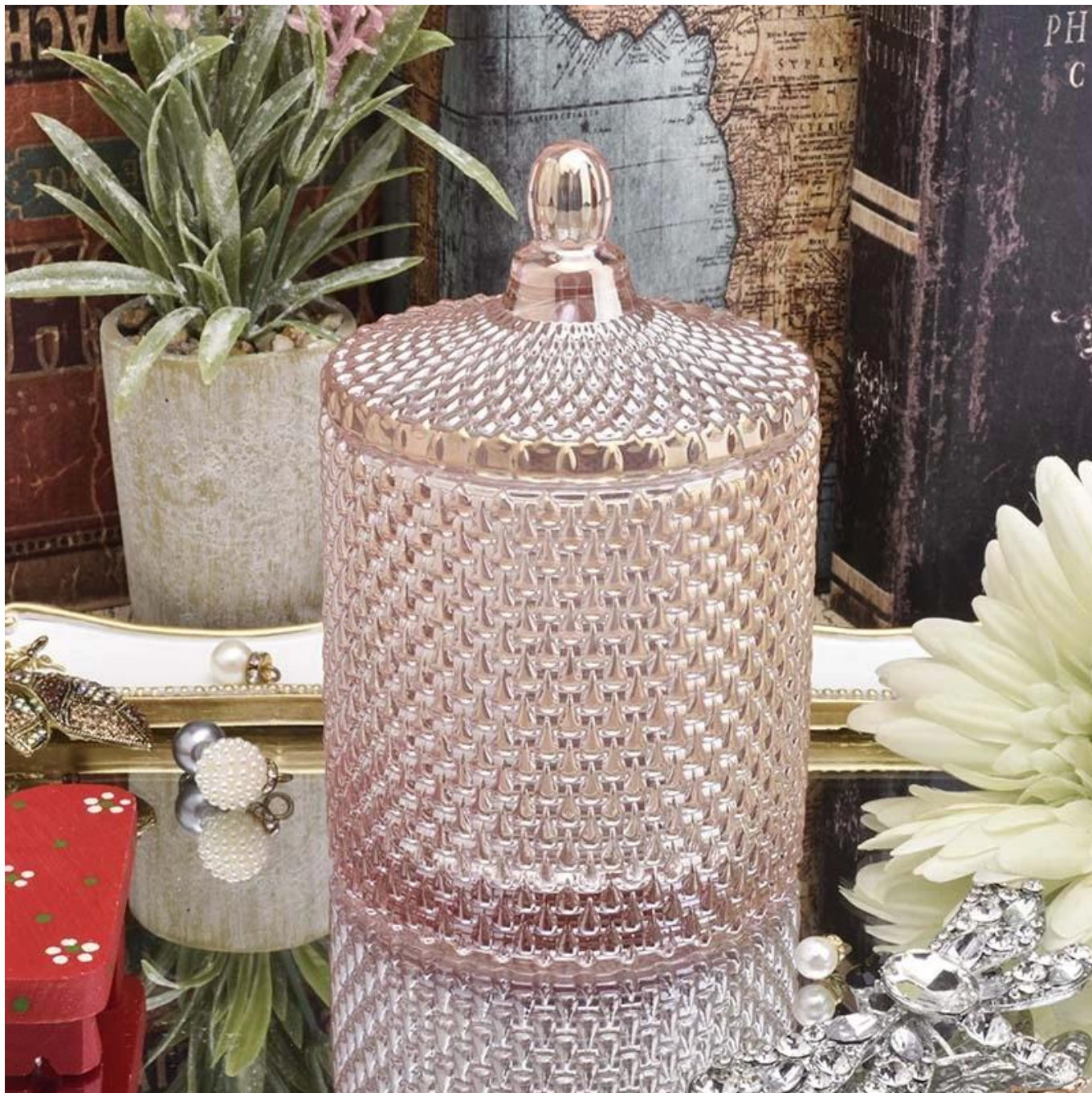
Range of the application