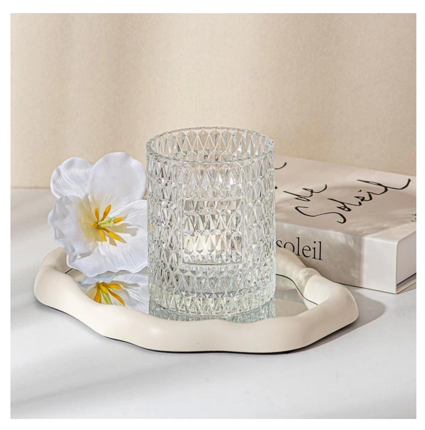
Illuminate your space with this exquisite machine press <u>candle glass jar</u>! Featuring a exquisite relief patterns, it creates mesmerizing light reflections.