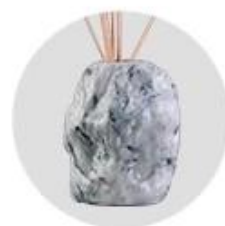
Water Transfer Printing