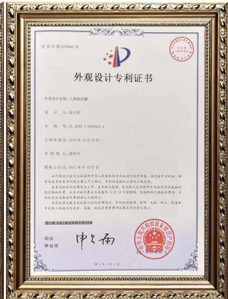
Patent Number: 20163065523.4