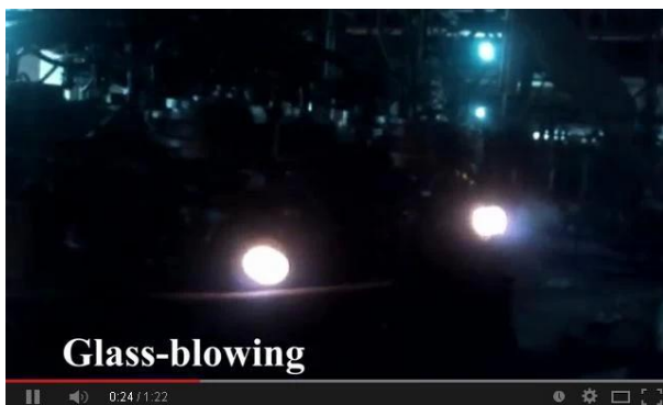
Machine blowing technology

Hereby watch our production line video online, welcome to visit us on site.