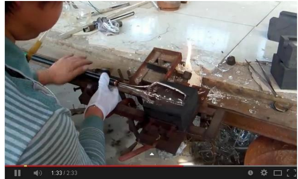
Hand blowing technique