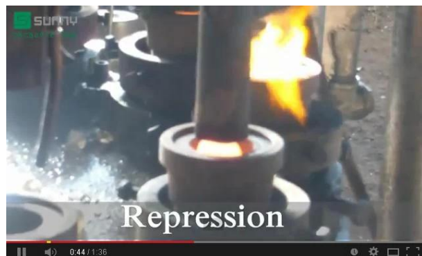
Mechanical press technology