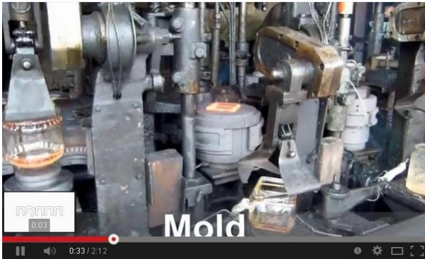
IS machine technology