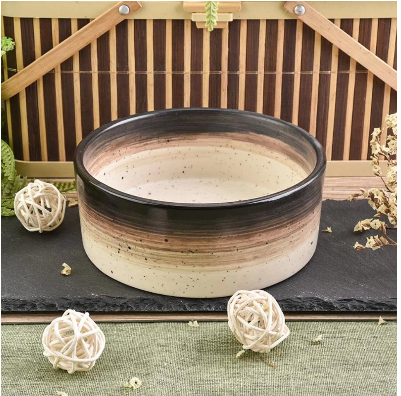
Candle lids accessories: