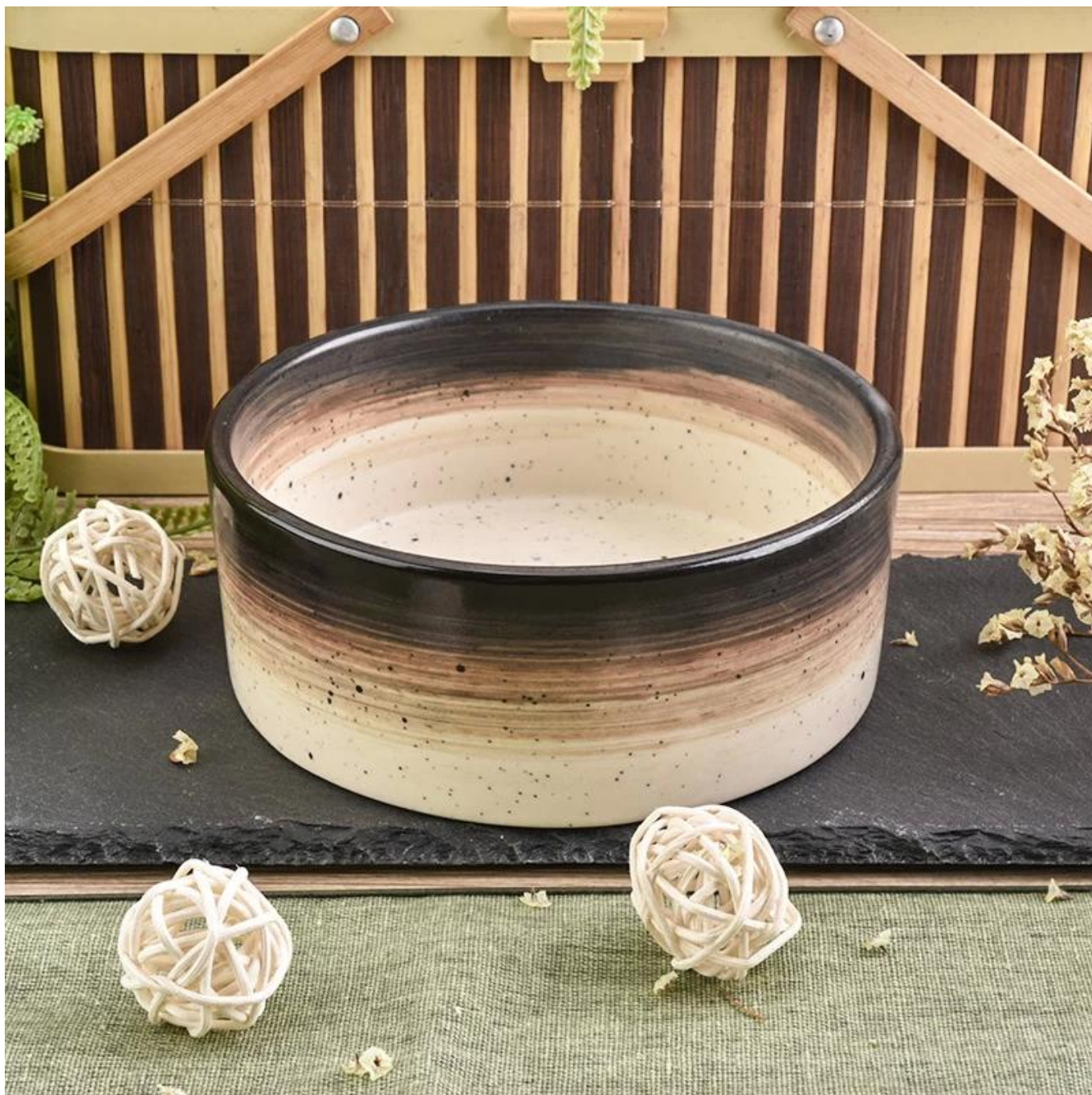
Candle lids accessories: