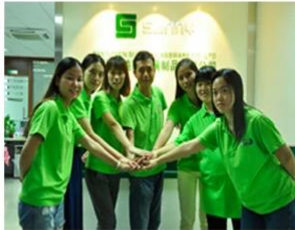
Sourcing & Doc Team