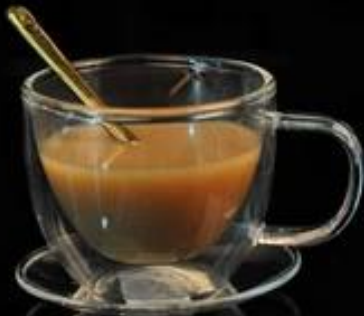
Double Wall Glass