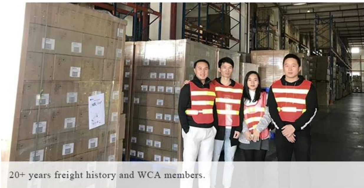
20+ years freight history and WCA members.