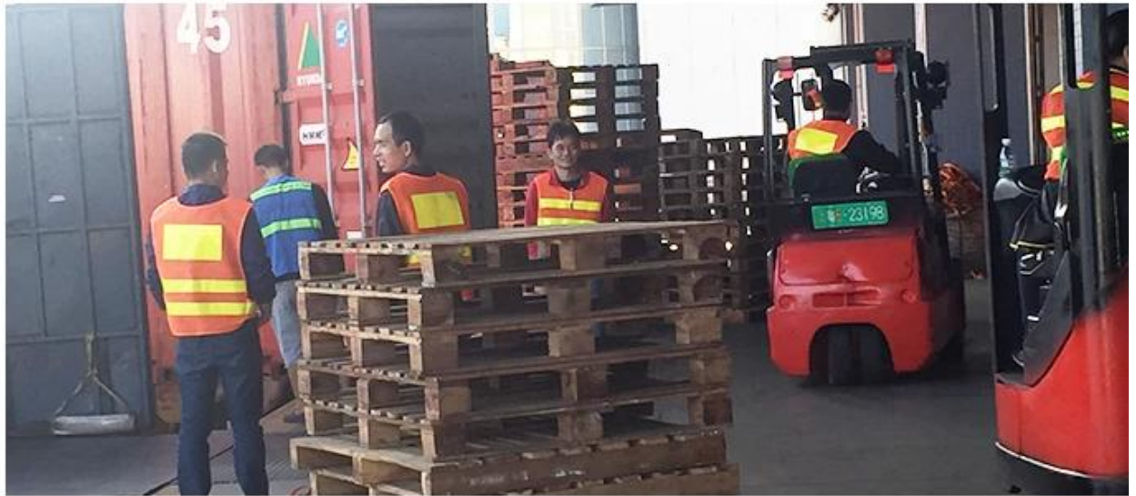
Own professional shipping company( Shenzhen Sunny Worldwide logistics)